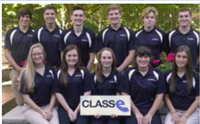
Coles County Entrepreneurship Class growing entrepreneurs, nurturing success