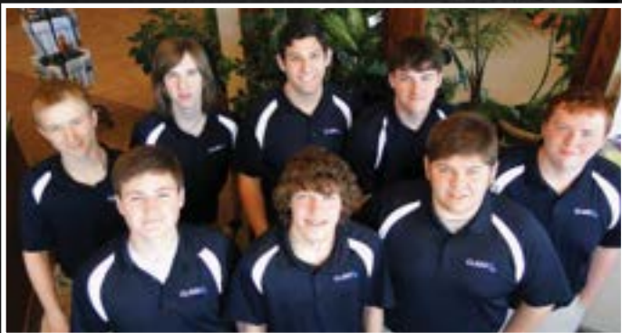
Coles County Entrepreneurship Class